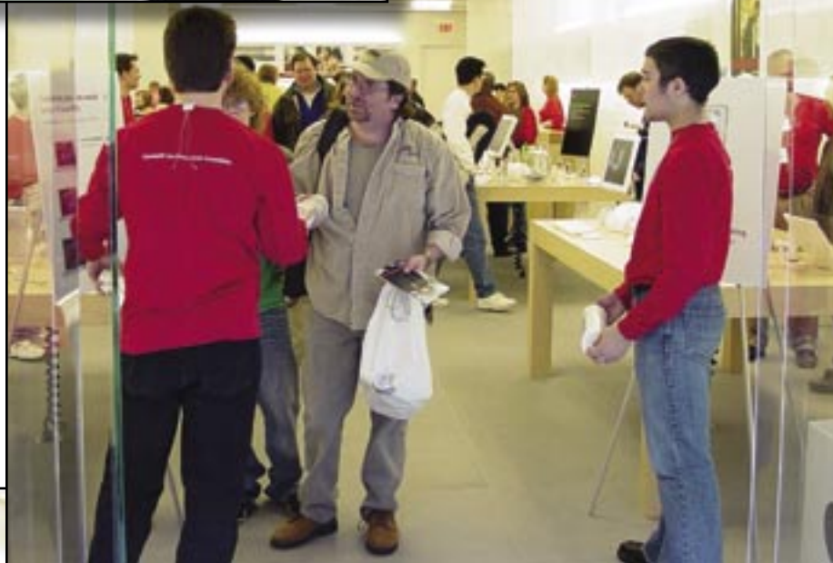
Guarding the gates: Apple employees poised at the glass doors hand out t-shirts to customers, and control access to the store — And yep, this was as close as we could come to the store with a camera. (center)