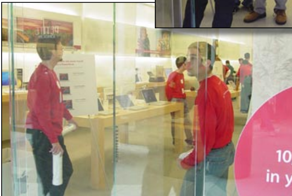
Outside, looking in. Another shot from outside the Apple Store through the windows, showing the interior of the store. (bottom)