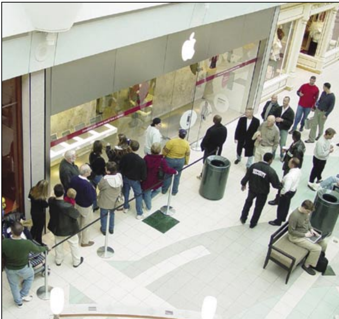
Apple Store Atlanta, take two. The facade of the Apple Store in Northpoint Mall, located on the first floor. During grand opening day, Apple fans waited outside for their turn to shop, while others mingled in the hallway outside.